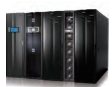
The Modulon DPH is designed in modern IT aesthetics aligned with Delta InfraSuite datacenter solutions.