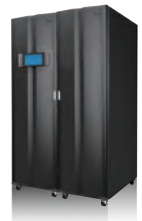
Optional switch cabinet with same IT exterior and dimension